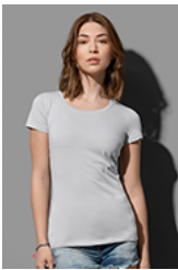
ST9700 Claire Crew Neck