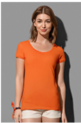
ST9120 Megan Crew Neck