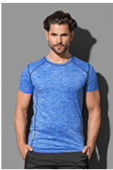
ST8840 Recycled Sports-T Reflect