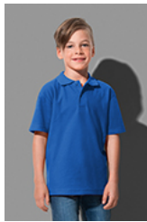
ST3200 Polo Kids