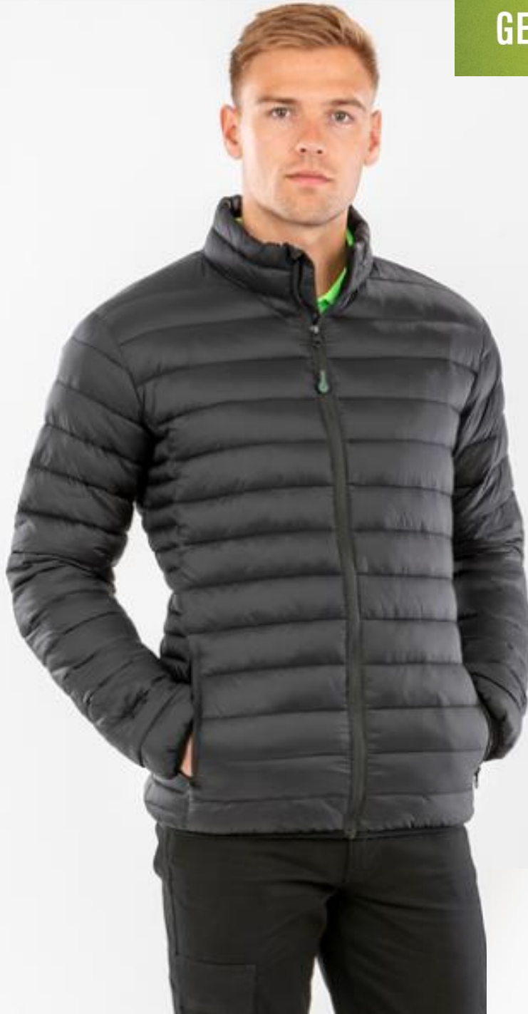
R912X RECYCLED PADDED JACKET